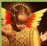
THE YES CENTER